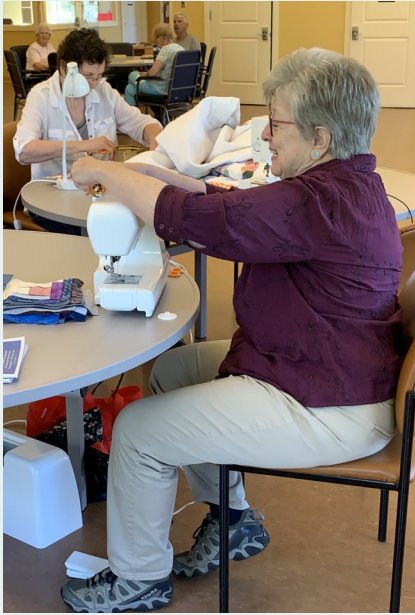
This is so much fun!

Tuesday, Wednesday and Friday the Senior Center is open 9am-3pm. The public is welcome to enjoy some social time! La Plata County Meal Information 970-382-6435