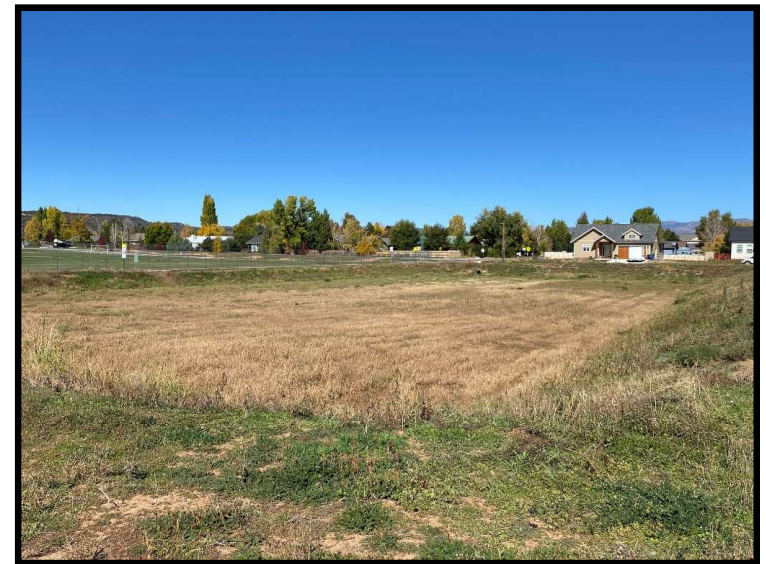
Clover Meadows Phase 7 Detention Basin