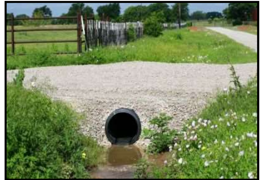
Private Culvert Under Private Driveway