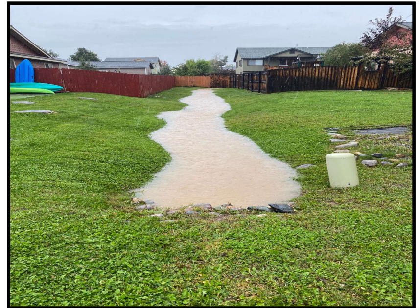
Clover Meadows Phase 6 Drainage Easement