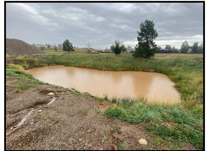
Joint County/Town Detention Basin