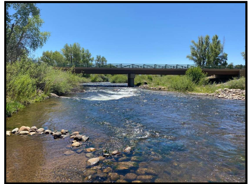
Los Pinos River Through Town