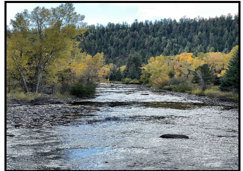
Los Pinos River North of Town